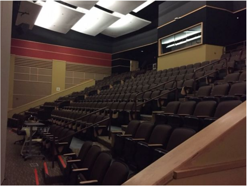
High School Overflow Space